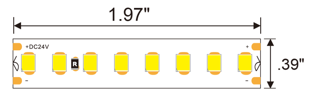
IP20 LED Strip